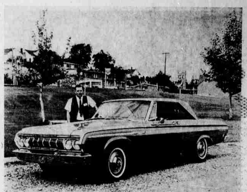
the new Plymouth Fury hardtop model. The new model features a redesigned front end and fenders with a massive front bumper and a wider grille. James is shown with the new Plymouth parked adjacent to Veterans Memorial Park. All new models are now available at Jim Olson Motors.