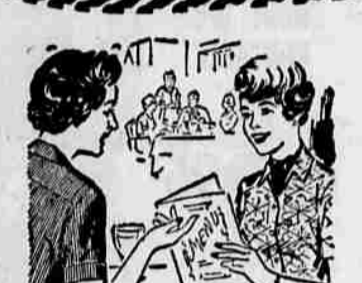
Husbands Like Lunch Out, Too!

Baling Twine For Sale Heaton Steel & Supply 428 Sprague TU 2-3426