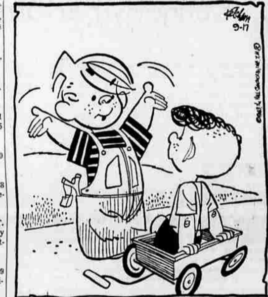
"IT'S LIKE A GREAT BIG PHONOGRAPH RECORD, WITH HORSES ON IT, AN' YA SIT ON A HORSE WHILE IT PLAYS MUSIC. THAT'S A MERRY-GO-ROUND!"