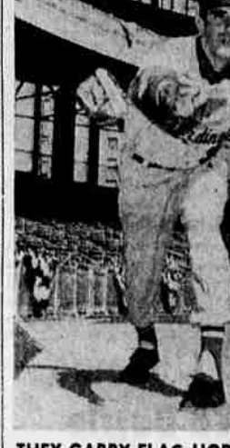
THEY CARRY FLAG HOPES — St. Louis Cardinal pitcher Ernie Broglio, left, (16-8) faces Los Angeles Dodger Johnny Podres, right, (13-10) tonight in the opening game of a three-game series in St. Louis that may well decide the National League pennant. The Cards, thanks to a double win Sunday coupled with a Dodger loss, trail the league-leading Dodgers by only one game. The Cards have won 10 straight and 19 of their last 20 games.

Hurl Four-Hitter Dick Farrell held the Mets hitless for six innings in the opener and then wound up with a four-homer in the seventh.