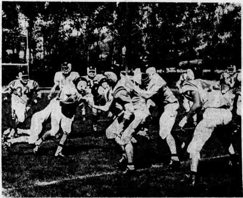
By United Press International The odds makers still like the Dodgers, but not by much because those incredible Cardinals can change the entire National League pennant picture tonight.

A victory by the Cardinals in the opener of a three-game set between the two clubs at St. Louis tonight not only would boost them into a virtual first-place tie but also would automatically make them the new pennant favorites.