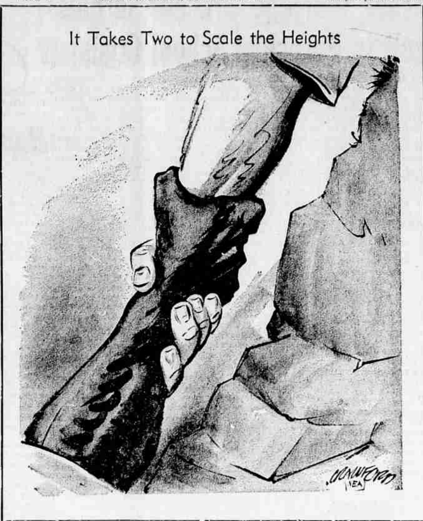
It Takes Two to Scale the Heights

Mr. Castro's present mildness could, conceivably, be part of an important new gambit of the Soviet bloc which Mr. Kennedy knows about because of his letter Mr. Khrushchev. But it could be tactical, too. Mr. Castro would have ample precedent for smiling while Soviet and western traders replenish his economic larders, only to turn on the Americas with renewed strength and aggression later on. These are surmises and Mr. Kennedy owes us some facts.