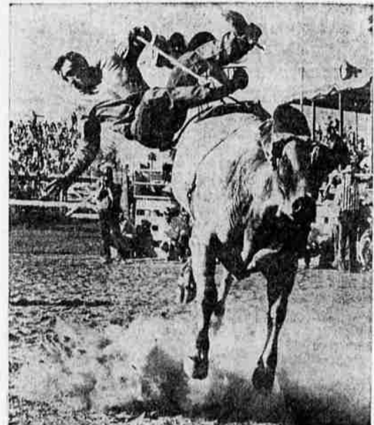
See bull riding, one of the round-up's most injury laden events. Here a cowboy heads for a crash landing after losing his grip on the braided rope nosed behind the bull's shoulders, the only hold he has to weather the stormy action.

The 1963 Klamath Basin Round-Up promises to be one of the biggest ever offered. 3 Big days of spills and chills that will keep you on the edge of your seat every second. You'll thrill to bronc bustin' . . . steer wrestlin' . . . calf ropin' . . . bull ridin' and everything that goes with a top, professional rodeo plus the addition this year of the fabulous Buffalo Scramble. See top cowboys from every point in the nation; famous clowns and other acts plus many city-wide attractions during the big 3-day event. It's a family affair so put it in your list right now!