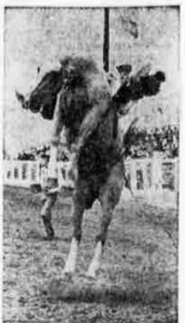
This bareback bronc gets all 4 feet off the ground as he attempts to dislodge his cowboy burden. Bareback riding has been a standard event in every rodeo for over 25 years.

FIREWORKS . . . No 4th of July celebration would be complete without them, and the Klamath Falls Fire Department puts on one of the biggest in the State. You'll be able to see it from all over town as they set off sky rockets galore from "K" Hill overlooking Klamath Falls.