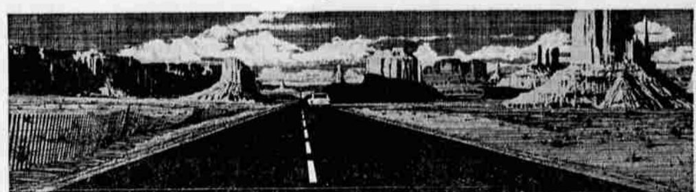
and get lost...

Chevy II Wagons —The heart of a suitcase. The rattle of a road map. There's something about one of these spruce, surprisingly spacious wagons that can turn even the routine preparations into a happy part of your trip. Take that old bugaboo of packing, for instance. No bother. With the kind of room you get in that easy-loading cargo compartment, you can just about toss things in any old whichway and come out with space to spare. The load won't dampen the spirits of the spunky 6-cylinder engine either. It just hums along chugging up gas pumps (there's also a choice of an even thrifter 4 in most