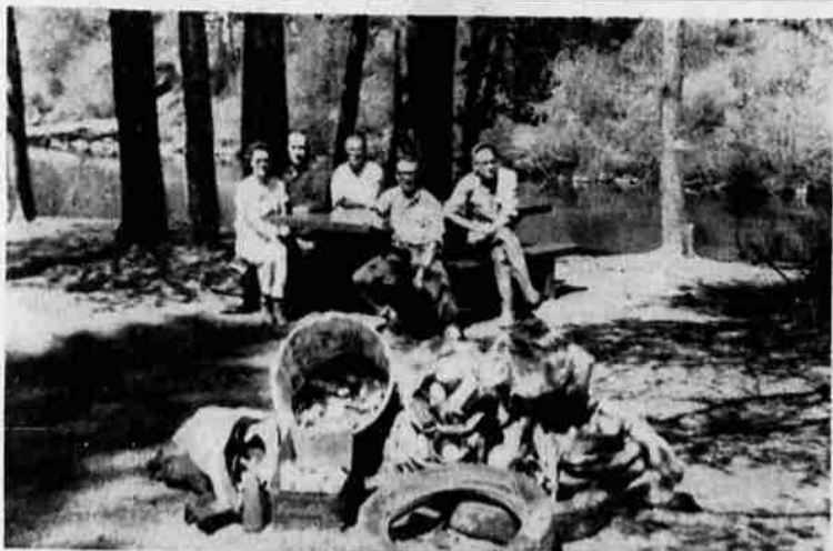
THAT'S THE LIMIT!!! — This big haul of trash wasn't taken from a local junk yard, but rather from the beautiful spring waters at the headwaters of the Wood River at Jason Kimball State Park. The limit haul of eight sacks of beer cans, pop bottles, tires, and other accessories, was taken by members of the local Isaac Walton League. The state spends taxpayers' money to develop its beautiful parks only to have half-witted yahoos desecrate them with such leavings. To protect the public investment in such parks as Jason Kimball it is up to each citizen to curtail his own littering habits.

The coaches, built by H. A. Pulaski, Inc., of Irwindale, Calif., were used in the 1880's on the narrow gauge Nevada-California-Oregon Railroad along the eastern slopes of the Sierra Nevada. The rails were made in the same period for the long gone Carson & Colorado Railway. They originally came around the Horn on a sailing ship. The roadbed is laid on hand-split ties.