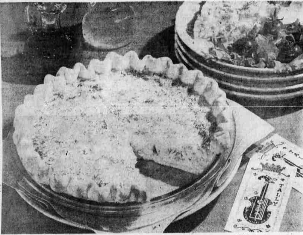
GET READY FOR HONORS — You'll tally a grand slam score as a hostess when you star this luscious Crabmeat Lorraine Pie at your next bridge luncheon.

Cook, uncovered, for one hour or until tender, in preheated 300-degree oven. Meanwhile, sauté one clove of garlic, finely chopped, and one teaspoon of oregano in one tablespoon of butter. In a cup, stir 1/2 cup of sauterne, a little at a time, into two tablespoons of arrowroot or six tablespoons of flour. After meat is tender, add both these mixtures to it and bring to boil. Adjust seasoning. Garnish top with 1/2 pound each of mushrooms, cooked and chopped, and ham cut into match-stick lengths, and 1/4 cup of chopped fresh parsley. Serve 4 or 6 with saffron rice. To reheat, allow 30 minutes in a preheated 350-degree oven.