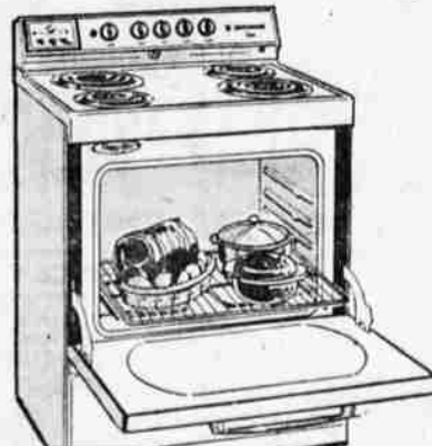
30" Electric Model RS-35-63