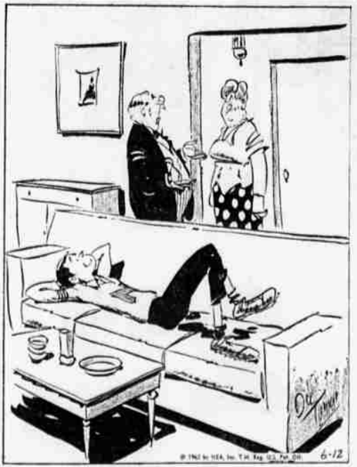
"How can you keep him from being bored at home now that school's out? Have you thought of changing the design of the paper on the ceiling?"