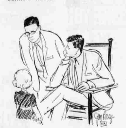
"Yeh, Mac, how many 'sides' DOES your Pentagon have?"