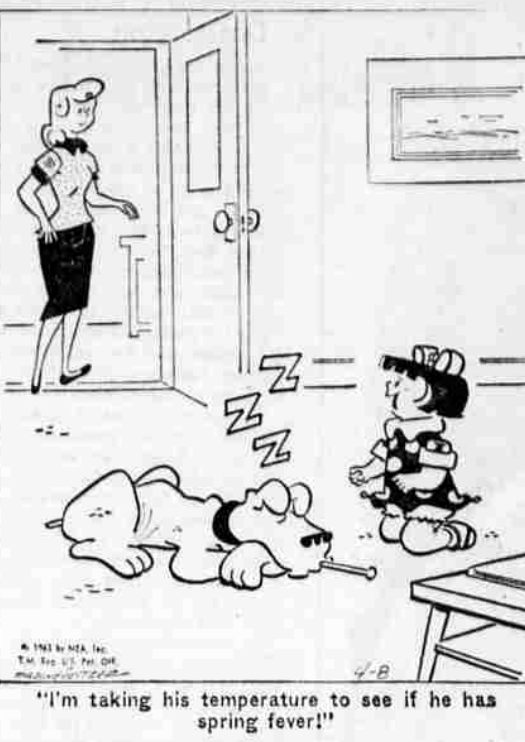
"I'm taking his temperature to see if he has spring fever!"