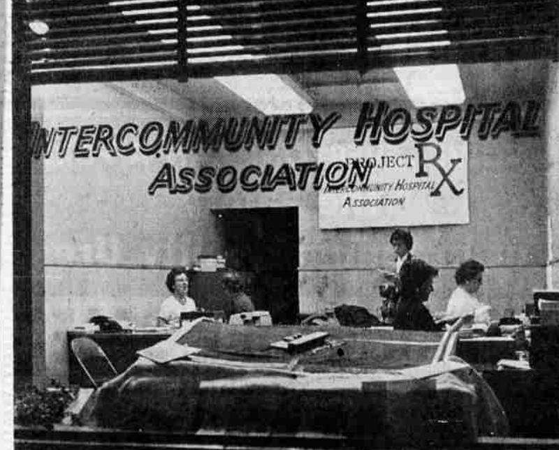
NIGHT FIGHTERS — Night fighters for the new hospital might well describe this evening view of the campaign headquarters. Several nights each week many women have given up their evenings to lend a big helping hand with the reams of typing and other processing of campaign literature.