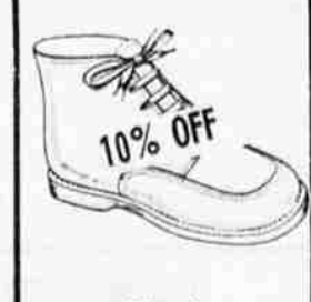
Biltwel INFANTS SHOES 359