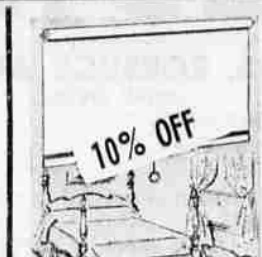
WINDOW SHADES 1.33