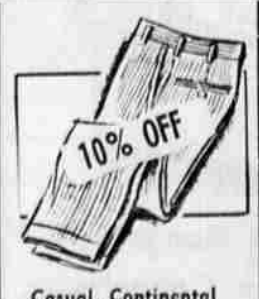
MEN'S SLACKS 449 River cottons. Easy care Solids and plaids Sizes