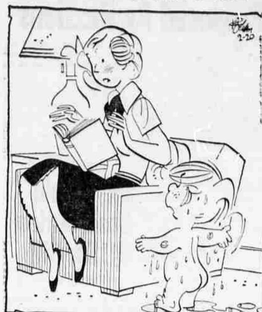
"Will you get TOM AN WILLIS OUT OF THE BATHUB SO ME AN' JOHN AN' DEWEY CAN HAVE MORE ROOM?!"