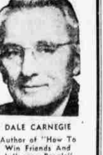
DALE CARNEGIE Author of "How To Win Friends And Influence People"

ATTEND A CLASS SESSION WITHOUT OBLIGATION TOMORROW Feb. 19th, 7:30 P.M. WILLARD HOTEL