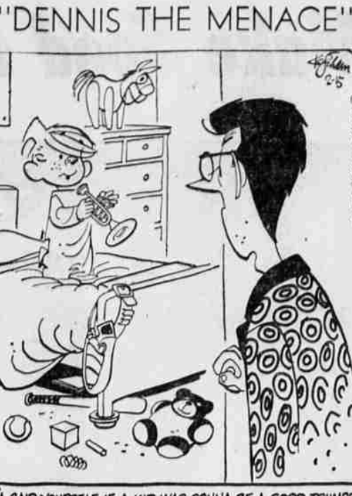
YA SAID YOURSELF IF A KID WAS GONNA BE A GOOD TRUMPET PLAYER, HE HAS TO START EARLY!