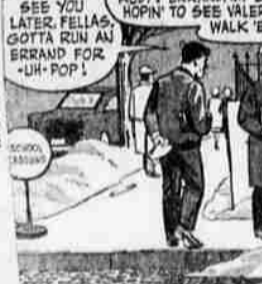
SEE YOU LATER, FELLAS! GOTTA RUN AN ERRAND FOR 'UH-POP'!