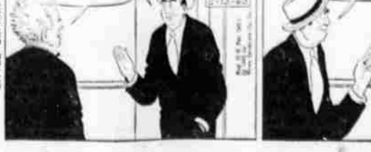
WHAT'S HAPPENED TO TH' FOUR PUNKS TH' OLD STRANGER ALMOST KILLED THREE WEEKS AGO, LON?