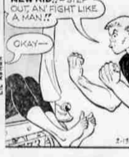
NEW KID!!—STEP OUT, AN' FIGHT LIKE A MAN!!