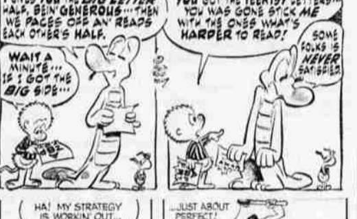
I GIVE YOU THE BIG LETTER HALF, BEIN' GENEROUS— THEN WE PACE OFF AN' REAPS EACH OTHER'S HALF.