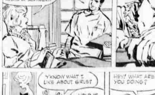
IN DEPARTING, DID MY HUSBAND Toss OUT ANY CHOICE SHAKESPEAREAN TORNTS OF SENTIMENT?