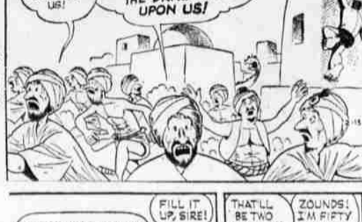
THE KAMAR HAS DESERTED US!