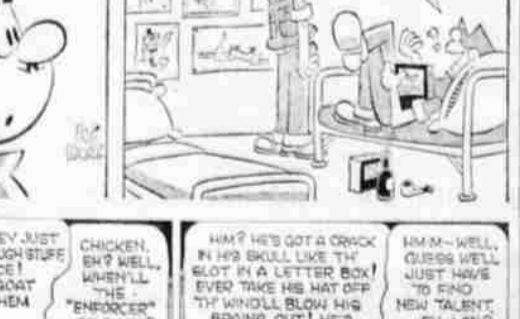
OKAY, I'M COMFORTABLE. GO AHEAD.