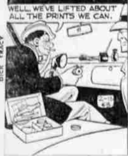
WELL, WE'VE LIFTED ABOUT ALL THE PRINTS WE CAN.