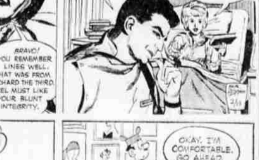
HIS CURTAIN LINE WAS 'FAITH HAS ITS WEAKNESS, BUT FAITHFULNESS IS A STUPID SUBSTITUTE.'