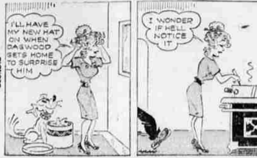
I'LL HAVE MY NEW HAT ON WHEN DADWOOD GETS HOME TO SURPRISE HIM