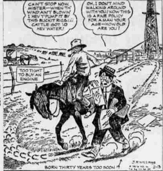
I LIKE YOU, MAJOR— WE THINK ALOT, NOW, IF YOU'LL EXCUSE ME, I MUST GET BACK TO MY WORK!— CAIN'T STOP NOW, MISTER—WHEN TH' WIND AIN'T BLOWIN' I HEU' TRUMPET BY THIS BUCKY REED— CATTLE GOT TO HEV WATER! OH, I DON'T MIND WALKING AROUND WITH YOU NOW THIS IS A RALE POLICY FOR A MAN YOUR AGE—HOW OLD ARE YOU?