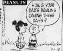
HOW'S YOUR DAD'S BOWLING COMING THESE DAYS?