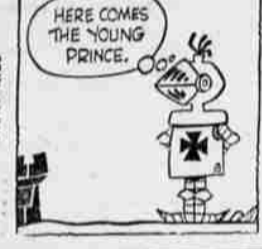
HERE COMES THE YOUNG PRINCE.