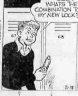
GOSH! WHAT'S THE COMBINATION TO MY NEW LOCK?