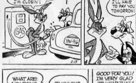
YA GOT HERE JUST IN TIME, SYLVESTER! I'M CLOSIN'!