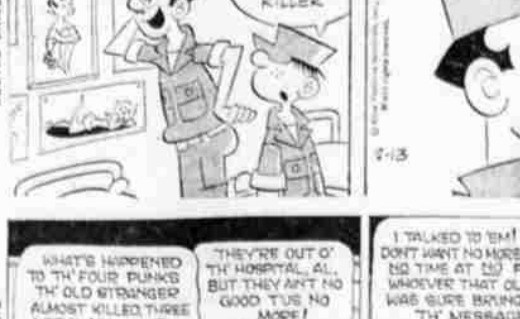
'KNOW WHAT I LIKE ABOUT GIRL? HOLD IT A SECOND, KILLER.