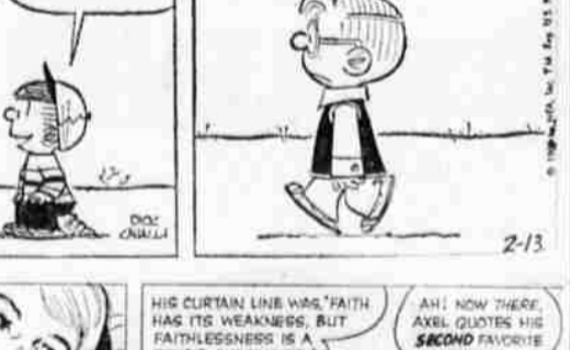
OH, WELL... AT LEAST HE IS THINKING.