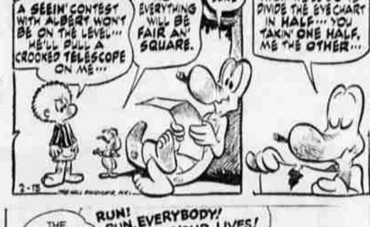
A SEEM' CONTEST WITH ABBEY WON'T BE ON THE LEVEL— HE'LL BULL A CROOKED TELESCOPE ON ME...