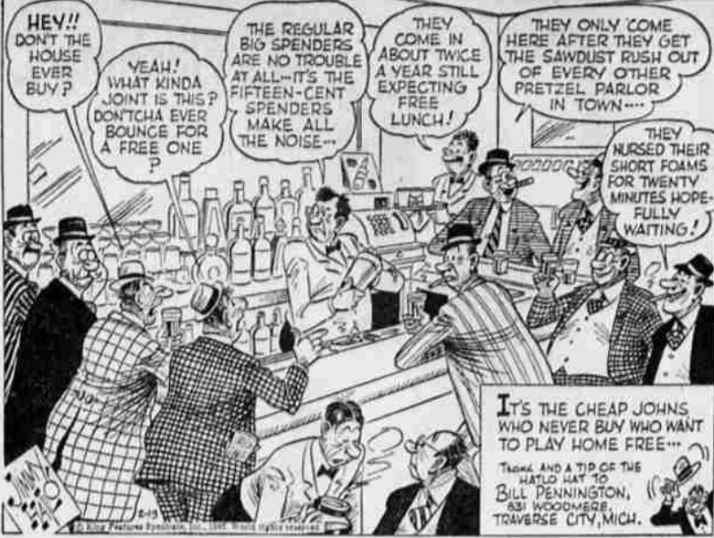
HEV!! DON'T THE HOUSE EVER BUY? THE REGULAR BIG SPENDERS ARE NO TROUBLE AT ALL—IT'S THE FIFTEEN-CENT SPENDERS MAKE ALL THE NOISE— THEY COME IN ABOUT TWICE A YEAR STILL EXPECTING FREE LUNCH! THEY ONLY COME HERE AFTER THEY GET THE SAWDUST RUSH OUT OF EVERY OTHER PRETZEL PARLOR IN TOWN— THEY NURSED THEIR SHORT FOAMS FOR TWENTY MINUTES HOPEFULLY WAITING! IT'S THE CHEAP JOHNS WHO NEVER BUY WHO WANT TO PLAY HOME FREE— Think, AND A TIP OF THE HATLO HAT TO BILL PENNINGTON, 831 WOODBINE, TRAVERSE CITY, MICH.