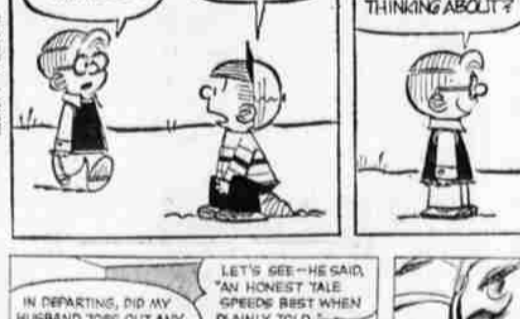
WHAT ARE YOU DOING, WINTHROP?