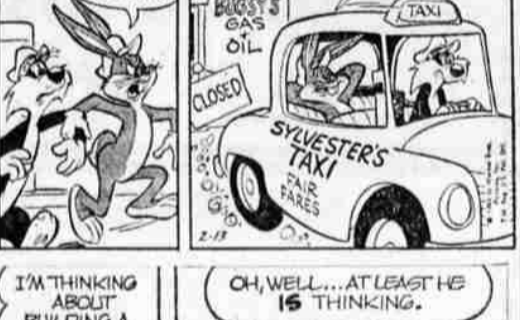
THAT MIGHT BE NEVER... I'VE GOT A SURE WAY TO GET MY DOUGH!