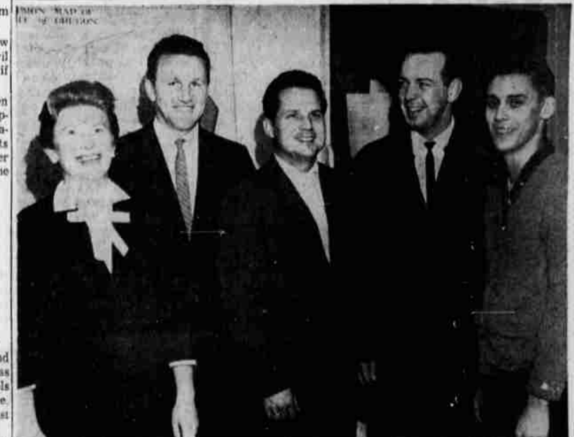
YOUNG REPUBLICANS ORGANIZE — Officers were named Tuesday night when the Young Republican Club of Klamath County organized.