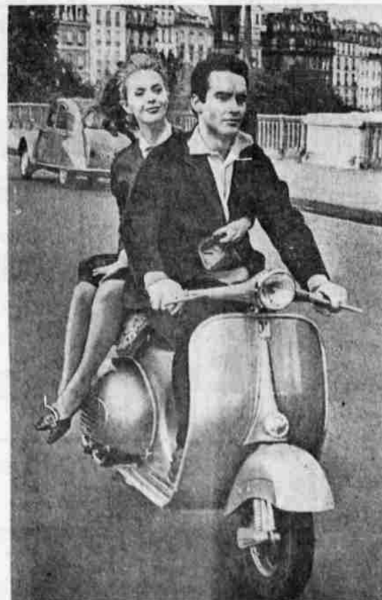
SCOOTING THROUGH PARIS — Actress Jean Seberg hitches a ride behind French actor Philippe Forquet as they scooter through the streets of Paris. Jean will appear with Forquet in Irwin Shaw's "In the French Style."