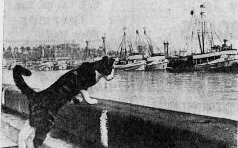
A FELINE FISHERMAN —The tuna fleet is in and this cat stands on a dock at San Pedro, Calif., dreaming of all the wonderful fish that will be unloaded. He was disappointed, however, the fish stayed aboard until fishermen and the canneries agreed on a price.