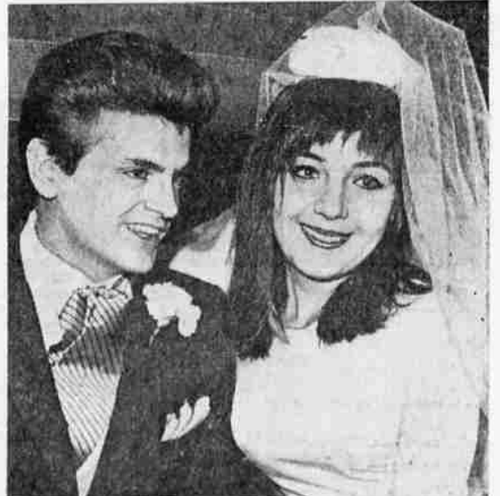
SINGING A HAPPY TUNE —Phil Everly, of the famed Everly Brothers singing duo, sits with his bride after they were married in The Little Church Around the Corner in New York. His wife is a 22-year-old student from Wisconsin.