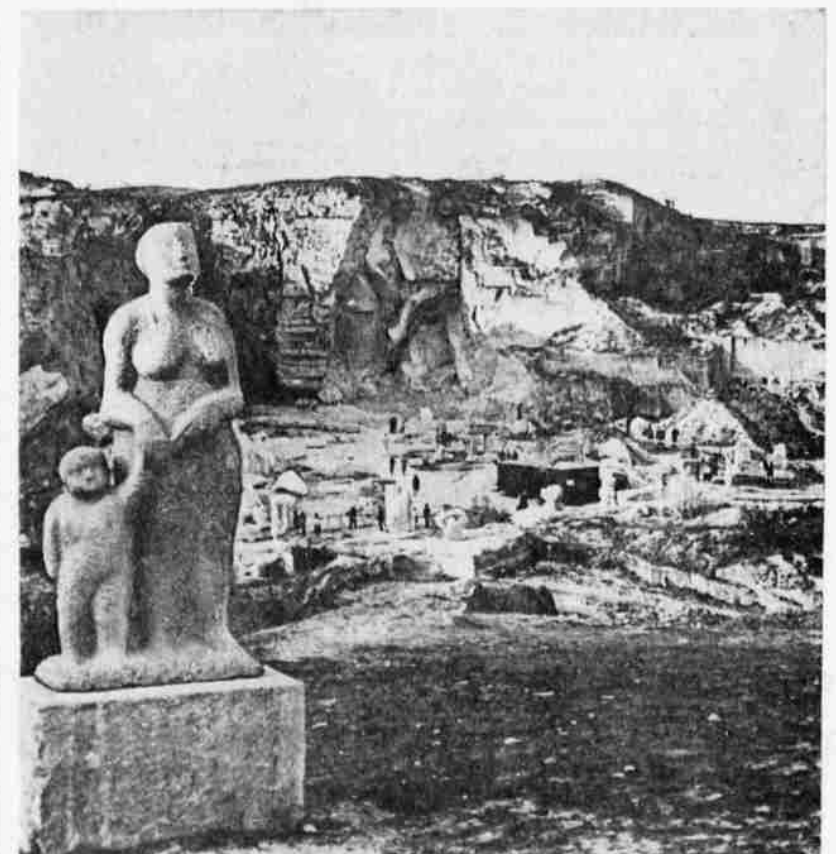
ART IN THE QUARRY —A stone quarry near St. Margarethen, Austria, has been converted into an outdoor art gallery in the wake of an international symposium of sculptors. The quarry, once worked by ancient Romans, provides a dramatic setting for modernistic statues like this "Mother and Child" (left).