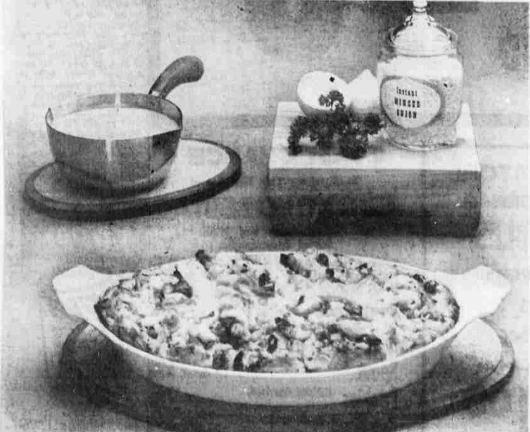
ALL WRAPPED UP — "Turkey in a blanket" takes care of leftover New Year's turkey in tasty fashion. Its "blanket" crust is spiced with instant minced onion and sage and turns left over fowl. Use chicken instead of turkey if yours is a small family that didn't buy a big bird into a glamour dish, good for a party. See story Page 4-C