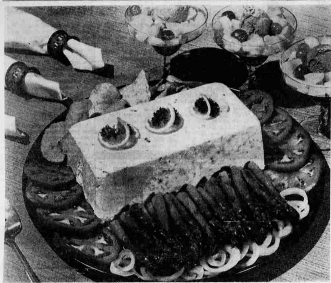
HEARTY—TASTY—ELEGANT — Here is a salad main course you'll invite to luncheon or dinner. It is Molded Tuna Loaf. It's family fare and company fare as well. Marinated canned asparagus spears look so pretty with the salad and are a good taste accompaniment, too. It's raspberry sherbet topped with canned fruit cocktail for dessert.