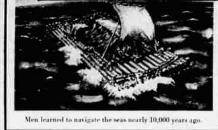
Men learned to navigate the seas nearly 10,000 years ago.