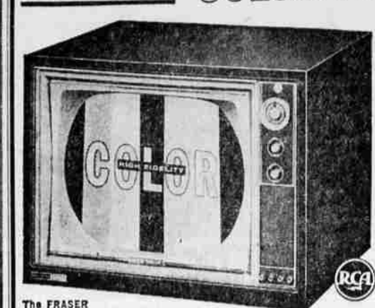
The FRASER Special Series 213-F-10-M 260 sq. in. picture

If you've been thinking of color TV, ask anyone who owns one! only $475 With Trade Only $6 A Week