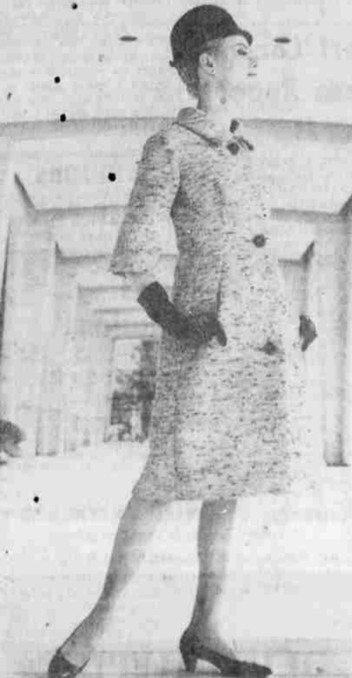
ON THE FASHION SCENE — The fabric industry has cooked up a whole soufflé of lightweights for spring. Elegantly sweeping into the foreground of the spring scene is this tweed coat from the 1963 collection of Monte-Sano and Pruzan. With three-quarter sleeves, it features a princess line done in a Lesur tweed of grey, black and white colors that blend in a semi-flat texture. Three large novelty buttons dot the front closing.

INCOME TAXES See Your Reliable Income TAX CONSULTANT CHAS. HATHAWAY Auditing - Bookkeeping 120 N. 10th TU 4-5473