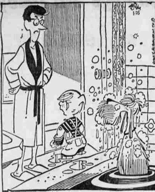
MOM! CAN YOU COME UP HERE AN MAKE DAD BE PATIENT?