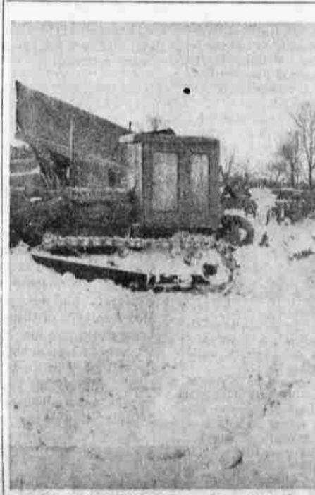
NO SNOW IN KLAMATH — Snowdrifts up to 10 feet high stranded thousands of motorists and residents southwest of Chicago Friday as shown in the picture above reminiscent of last year in Klamath Falls. Snow removal equipment faces a tough task in the east as drifting snow continued to block roads in the east's most bitter winter of the past century.

Klamath County's Legislative delegation has unanimously requested the city council to turn down a request for rezoning an area adjacent to the OTI campus site to permit construction of apartment dwellings.