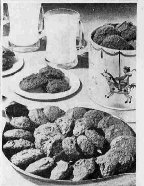
NUTRITIOUS — Cookies can be full of body-building nutrients as well as being tasty if you use wheat germ in place of part of the flour. These cookies are especially good for the small fry.