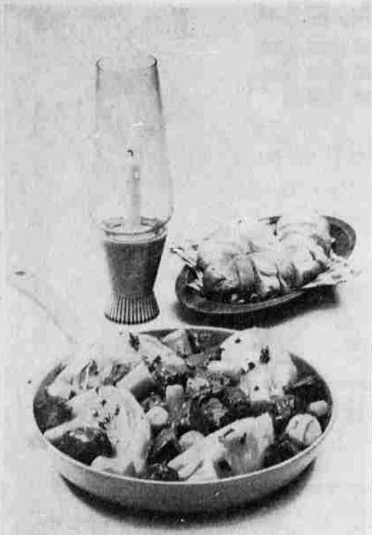
CHASE THE CHILLS — It's a rosy beef stew for dinner tonight. This chill-chaser, a tasty, one-dish meal, has cubes of browned beef, golden carrots, and wedges of cabbage cooked together in a canned condensed tomato soup sauce. Serve with thick slices of French bread.