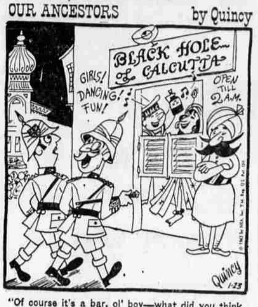
"Of course it's a bar, 'ol boy—what did you think it'd ha?"