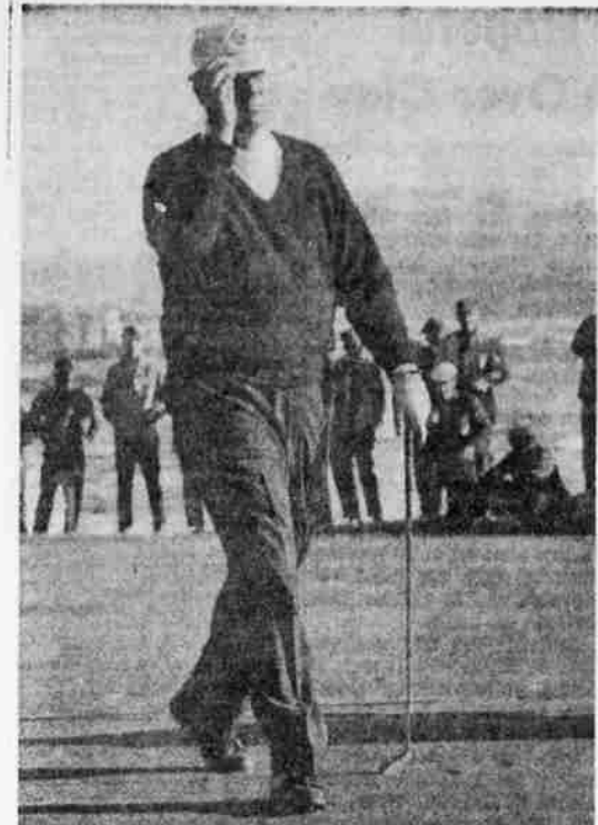
HOLDS WINNING BALL — Billy Casper walks off the 18th green at Pebble Beach, Calif., holding the ball that won him the Bing Crosby tournament Sunday. Casper shot a par-5 on the 18th to give him a total score of 285 for the tournament.