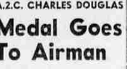
A.Z.C. CHARLES DOUGLAS Medal Goes To Airman

SALEM (UPI) - Elimination of the death penalty and life sentences without possibility of parole were included in measures given their first reading today in the Senate.