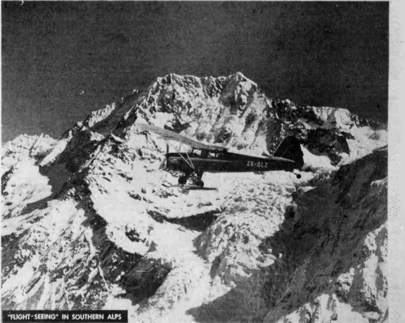
"FLIGHT-SEEING" IN SOUTHERN ALPS