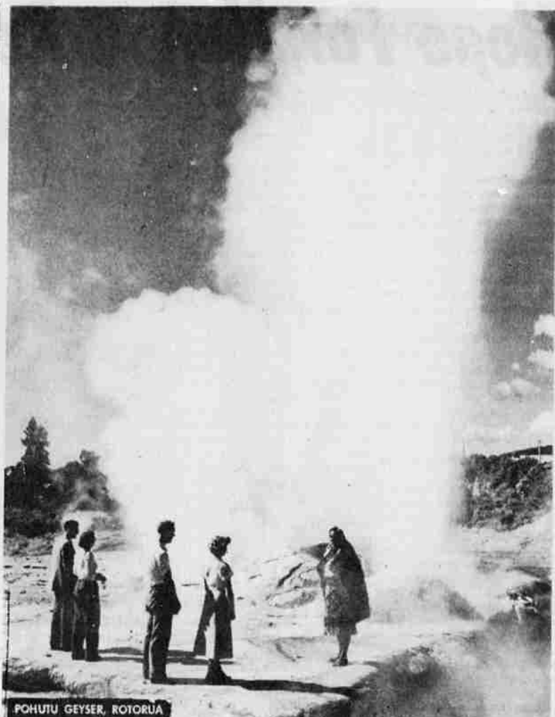
POHUTU GEYSER, ROTORUA