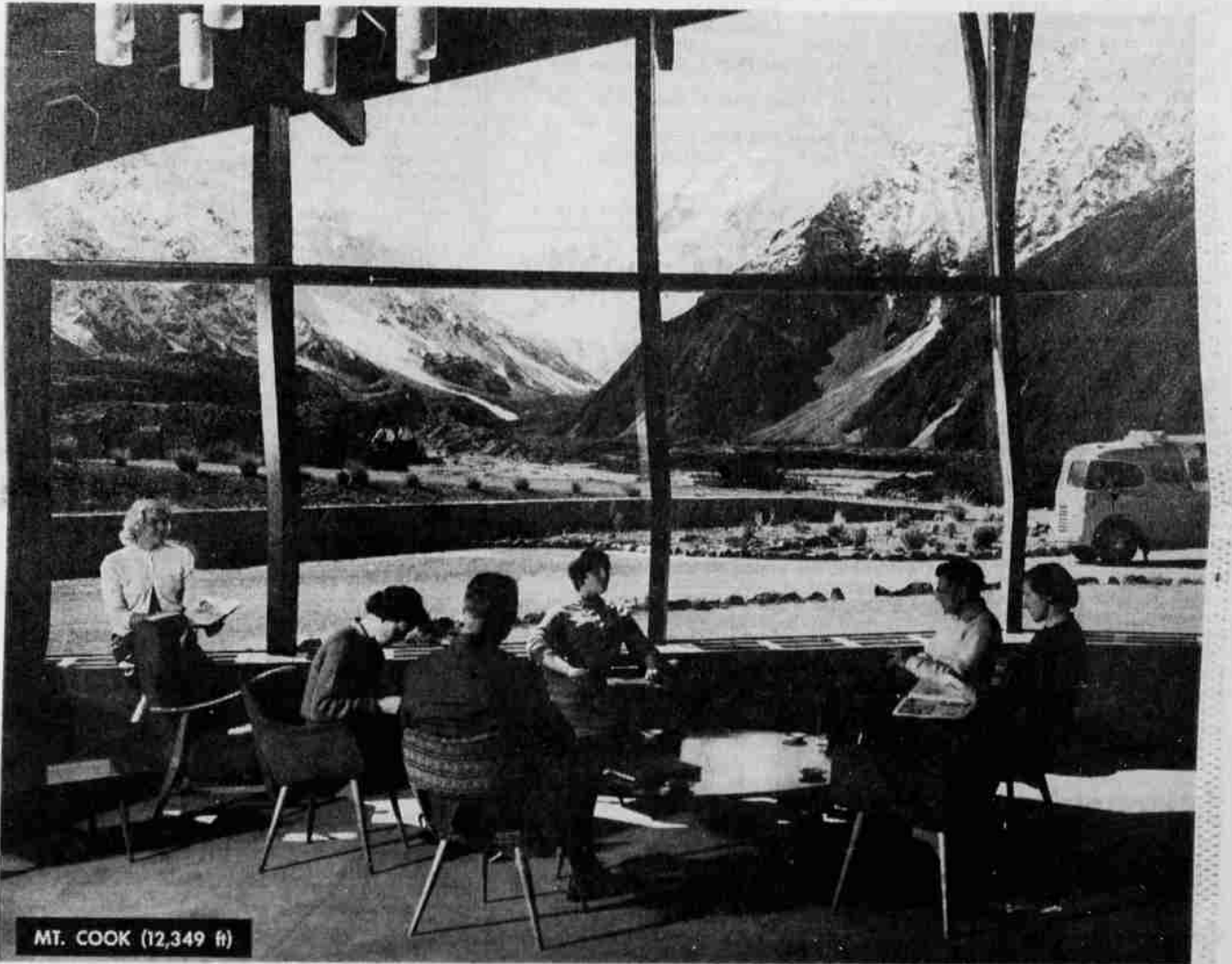
MT. COOK (12,349 ft)