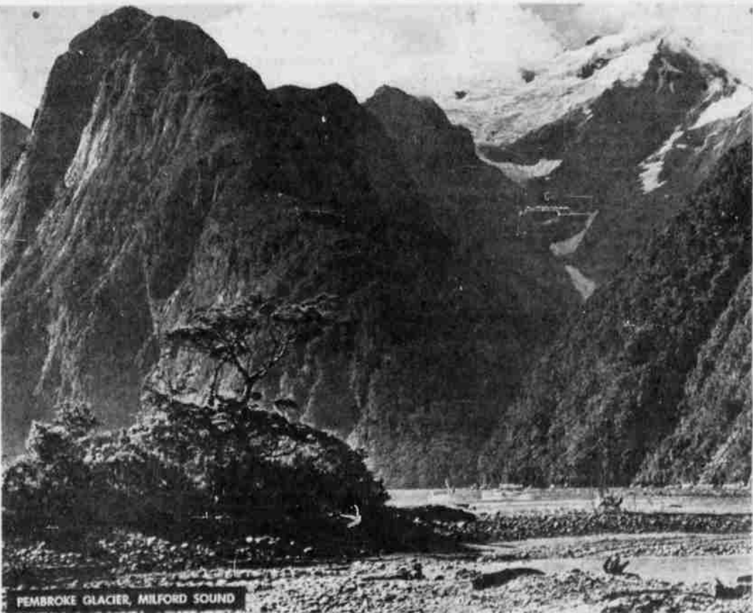
PEMBROKE GLACIER, MILFORD SOUND