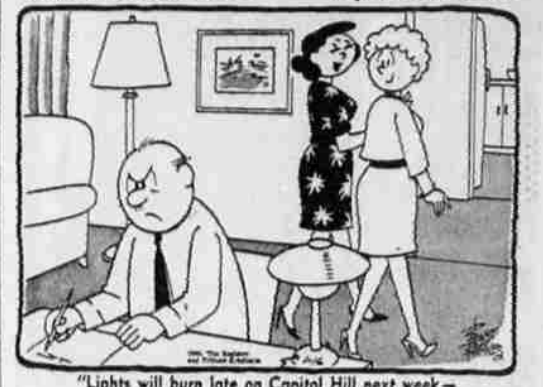
"Lights will burn late on Capitol Hill next week—Stanley is writing his congressman."