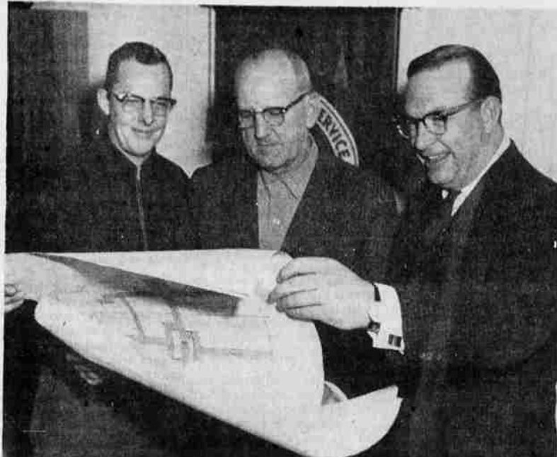
HOSPITAL FUND DONATION — The Board of Directors of the Klamath Falls Exchange Club at a Jan. 11 meeting announced the club would donate all proceeds from its coming circus to the Presbyterian Intercommunity Hospital, Inc., fund. The board members specified that the donation is to be used for the children's ward at the proposed hospital.

By United Press International Sub-zero temperatures clung to the Midwest today after the mercury fell as far as 50 below in one of the harshest cold spells in 75 years.