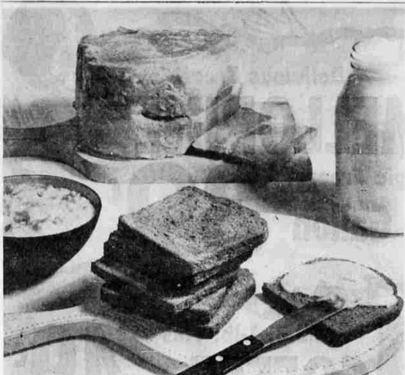
EASY TO SCOOP — Sandwich making is easy with either a mixed filling, such as the Pimento Cheese filling or ham, when the mayonnaise is from the new, "easy scoop" jar now being used by the processor. No more messy cutlery or fingers.