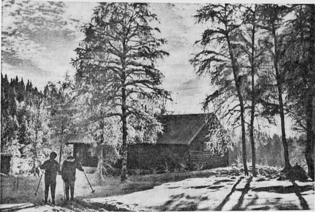
A PICTURE IS WORTH A MILLION WORDS —Like Hansel and Gretel arriving at the gingerbread cottage, these two skiers come upon a cabin under snow-covered trees at Oslo, Norway, a winter wonderland that defies description.