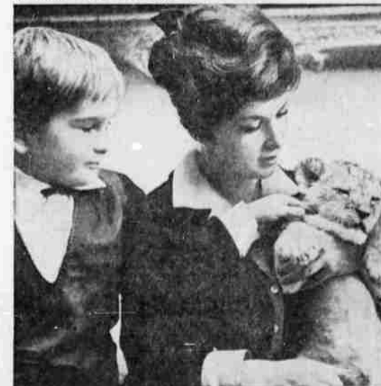
MAKING FRIENDS —Gina Lollobrigida and her son cuddle a lion cub named Milko at the actress' Rome home. She purchased the animal for a lion-tamer friend as a gift.