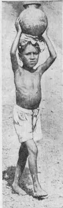
ROADSIDE FISHING —Natives of Bengal, India, supplement their food supply by fishing in irrigation ditches and roadside streams. This boy carries his "catch" on his head.