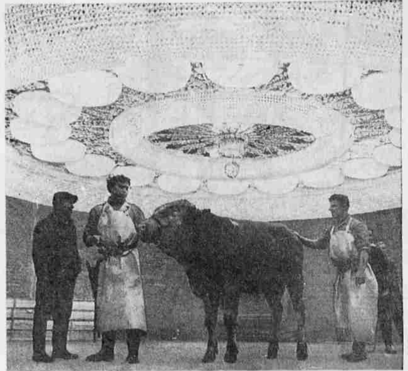
A REAL COW PALACE —This husky creature doesn't seem impressed by the 3½-ton chandelier gracing the ceiling of this West German slaughterhouse. The firm that produced the some 532-bulb lighting fixture found that this was the only place to store it until shipment.