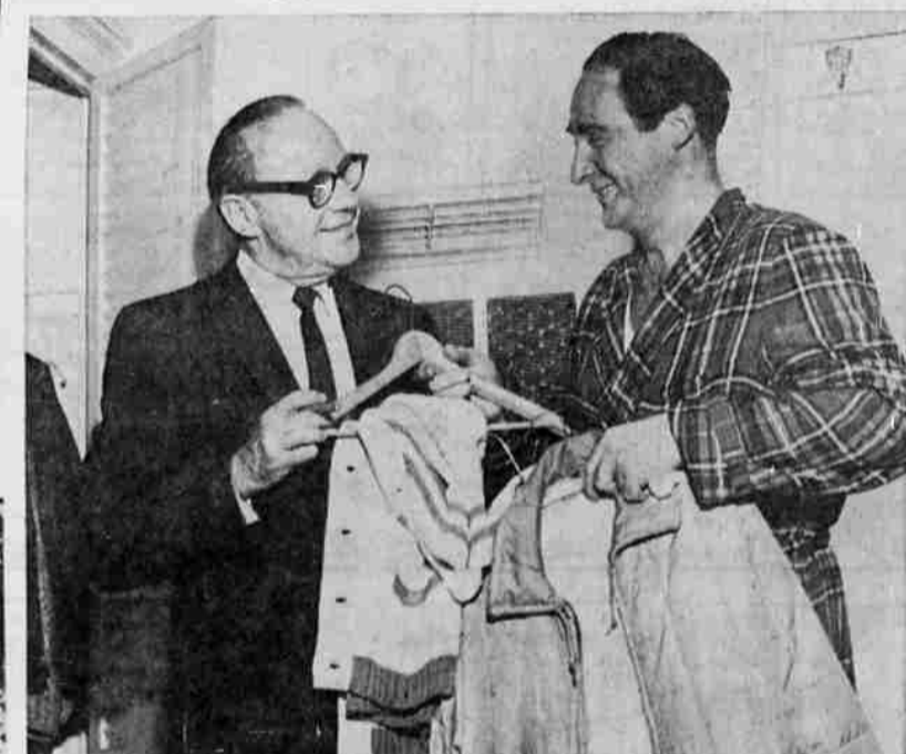
RETURN OF THE PRODIGALS —Sid Caesar has returned to Broadway in the musical "Little Me," after a 14-year absence, and now Jack Benny has decided to take the plunge. Here he gets a few tips from Sid.