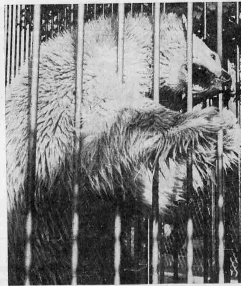
A ROARING PERFORMANCE —This 170-pound giant is "Donny Boy," a polar bear at a Washington, D.C., zoo, giving a stand-up performance. He doesn't seem to like his new home and is making every effort to break through the bars that surround him.