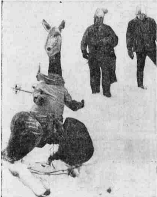
DOING A DOUBLE TAKE —That's the reaction of Laconia, N. H., skiers when Charley, the (stuffed) kangaroo, skims past them on the slope.