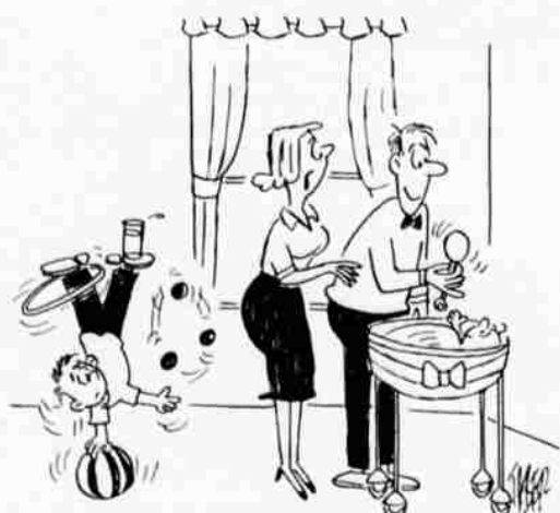
"I think we're paying too much attention to the baby."