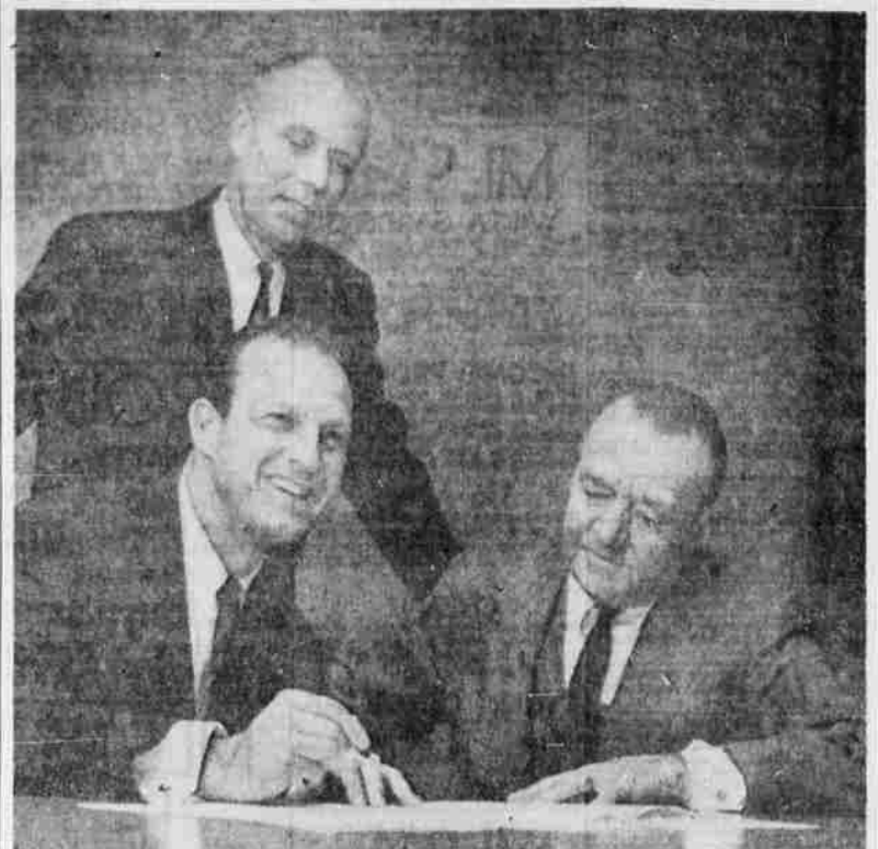
MUSIAL SIGNS 22ND PACT — Signing his 22nd contract with the St. Louis Cardinals in St. Louis Thursday, Stan Musial begins his 25th year in pro baseball. As Cardinal owner, August A. Busch Jr., and general manager, Bing Devine, center, nod approval. Musial told reporters that at his age, he would play one year at a time and if he has a good season this year, he will consider a 1964 contract.