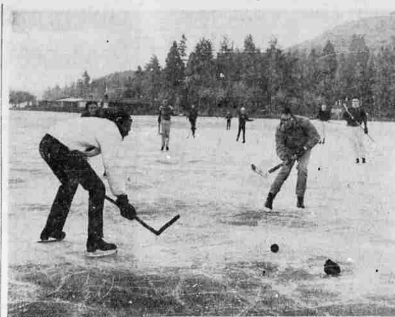
FUN ON THE ICE - The majesties of the winter season brought forth this picture of youngsters enjoying a hockey game on the ice of Upper Klamath Lake. Ice skaters turned out over the weekend and the New Year in almost all areas where water had frozen in ponds, lakes and canals. Authorities, however, warned skaters to be particularly careful, especially in the Upper lake areas where hot springs tend to make any ice thin and skating hazardous.

Sees Tough Tax Sledding If the Rules Committee is kept at 15 members as the administration desires (Chairman Howard Smith of Virginia would like to see it revert to 12), Kennedy then sees an opportunity to bring even controversial legislation to the floor for a vote. To keep vital bills off the House floor would be bad public policy in his opinion. Furthermore, Kennedy feels it would be a terrific irony for Republicans, as well as for good many Democrats, to put the powerful Rules Committee in control of those usually opposed to almost any action the Kennedy leadership would want to undertake.