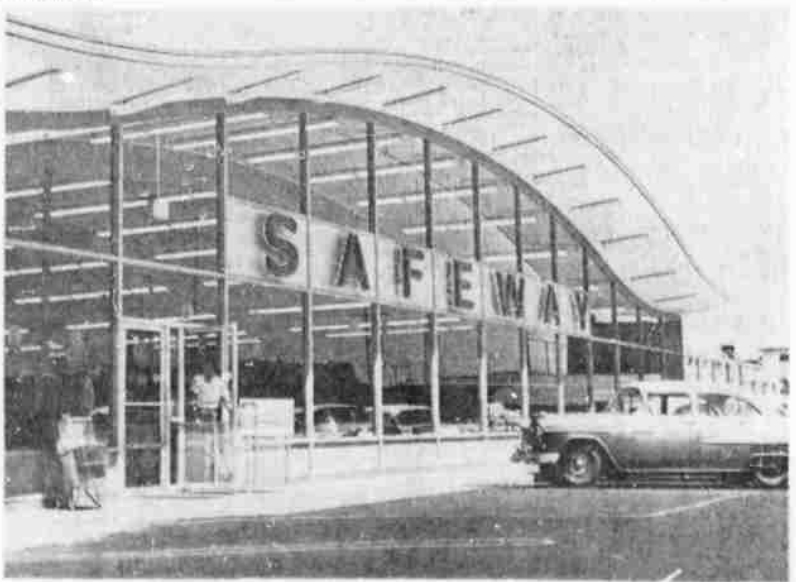
NEW STORE OPENS — The new Safeway Store at Ninth and High streets was open for business on May 28 and the old store was then demolished. Bowden Brothers Construction Company of Portland were contractors for the structure which cost about $90,000. The area occupied by the old store was converted into paved parking space.