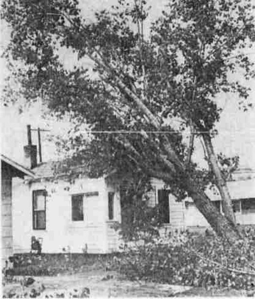
STORM BATTERS AREA — A mid-October storm that was tagged as the tail-end of typhoon Freida smashed into the state and caused damage estimated in excess of $20 million. However, much of the local area escaped with only wind damage to roofs . . . and trees. In this view, a large tree leans on a home at 2212 Oak Street. Falling trees did minor home damage and blocked highways in the area. The west side of the Cascades, however, bore the main fury of the storm.