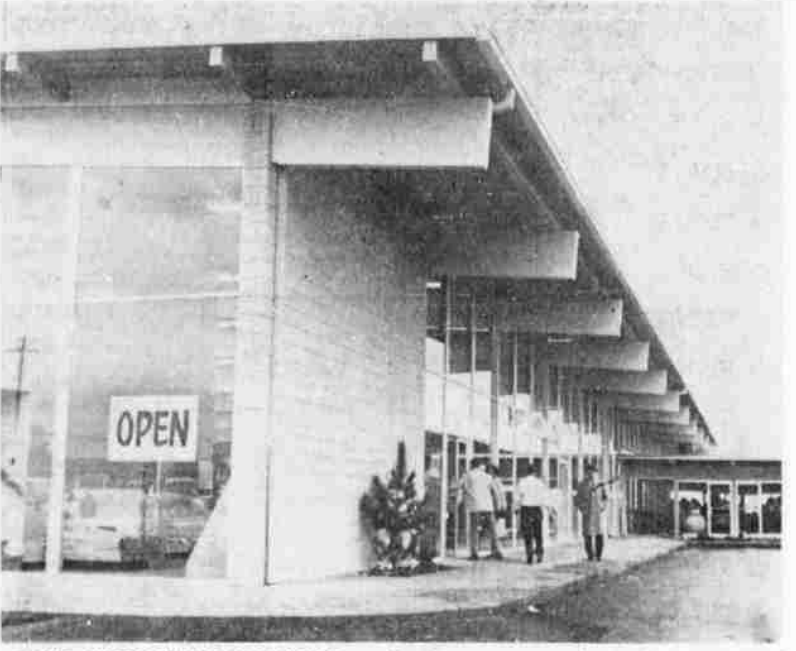
GIANT SUPERMARKET COMPLETED — The biggest supermarket in the area opened its doors in mid-December. The new Oregon Food Store occupies more than 28,000 square feet of space and provides additional space for such other enterprises as a bakery and other Oregon Food Store activities. The new market provides parking space for more than 300 cars and was constructed at an estimated cost when fully equipped of approximately $400,000. Located on Avalon between Shasta Way and South Sixth, it is slated to be the first in a new shopping center development in that area.