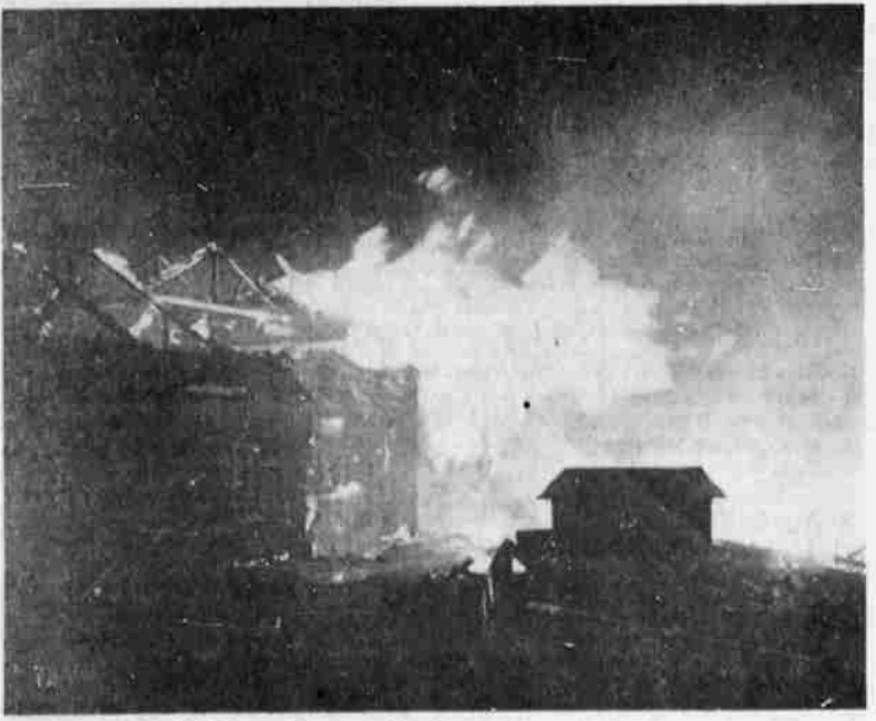
SPECTACULAR BLAZE — Flames did little more than aid the dismantling job at the site of the old Klamath Lumber and Box plant at Pelican City on Monday, July 2. Flames lit the sky. This view shows the burning structure. Most of the equipment had been moved out following the sale of the entire plant at auction several months before. Firemen prevented the blaze from spreading.