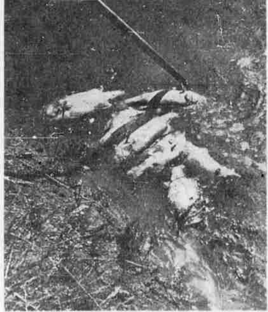
FISH KILL PROBED — In early August reports of a big fish kill on Lost River brought pictures such as this one showing rainbow as well as bass killed in a short stretch of Lost River just below Olene. Authorities later said it was caused by a lack of oxygen just below the dam coupled with insecticides from irrigation ditches being cleaned in the area.