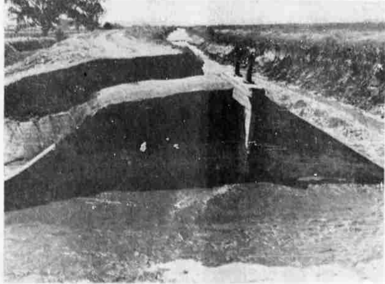
CANAL BREAKS — Water pours through a 60 to 80 foot break in the D canal in this photo about three miles east of Merrill on Tuesday, Aug. 21. The break swept out a concrete spill and flowed into a big drain averting any serious flooding of surrounding farmland. It was quickly repaired.