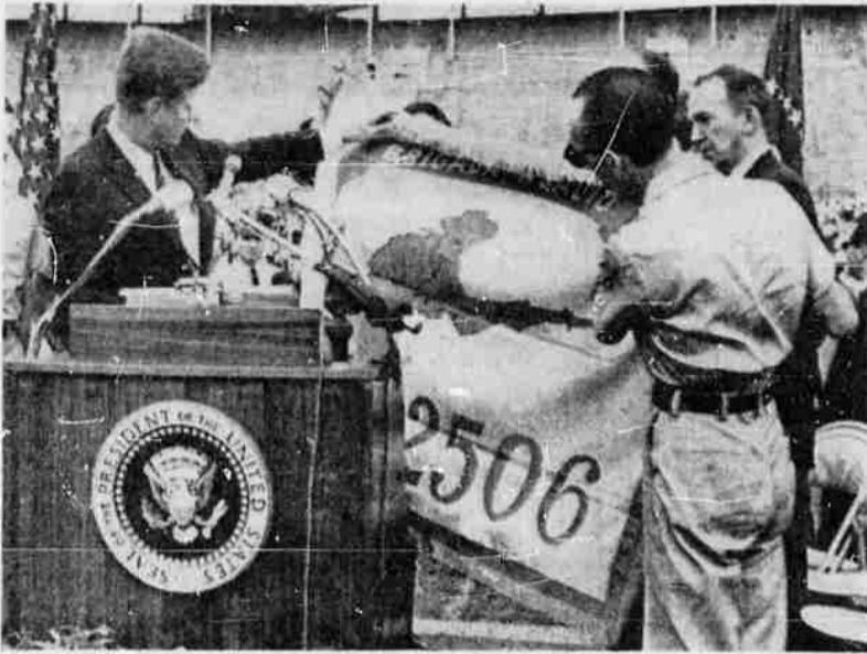
CUBAN BATTLE FLAG — At Orange Bowl ceremonies Saturday honoring the returned invasion prisoners, President Kennedy is presented with the battle flag of the 2506 Assault Brigade. 40,000 emotion-choked Cubans heard the President's talk followed by a speech in Spanish by Mrs. Kennedy.