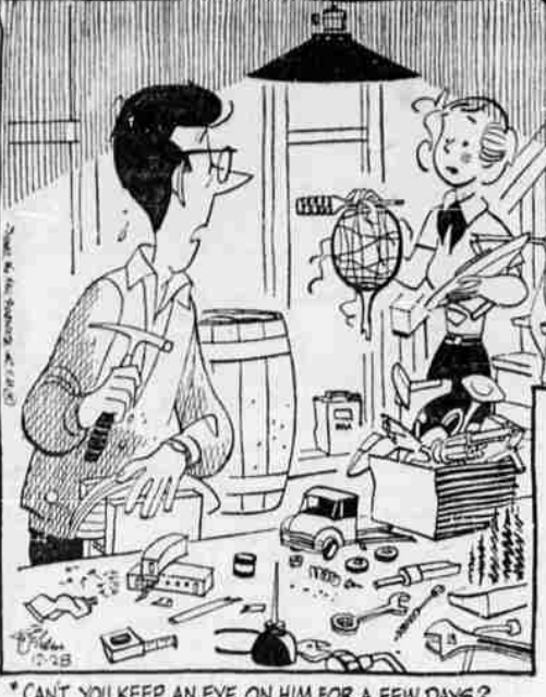
CAN'T YOU KEEP AN EVE ON HIM FOR A FEW DAYS ? HE'S GETTING AHEAD OF ME!