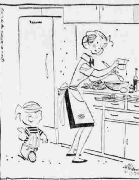
"YOU KNOW THAT VASE IN THE OTHER ROOM YOU SAID YOU WERE GONNA GET RID OF SOMEDAY ANYWAY?...."