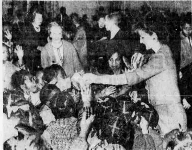
FIRST LADY VISITS — Mrs. Jacqueline Kennedy hands out lollipops to eager children during her visit to the D. C. Village for homeless and under-privileged children in Washington, D. C., Dec. 13. The First Lady chatted with the children and admired their handiwork.