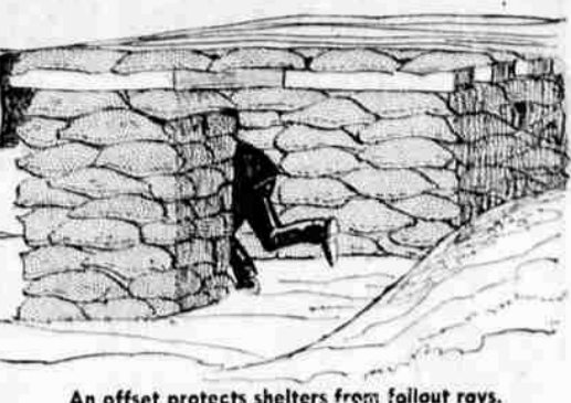
An offset protects shelters from fallout rays.

The roof and upper stories of a house would keep much fallout