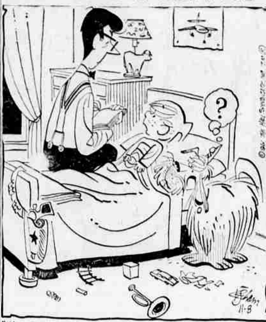
"WILL YA READ THAT PAGE OVER? I DON'T THINK RUFF GOT IT."