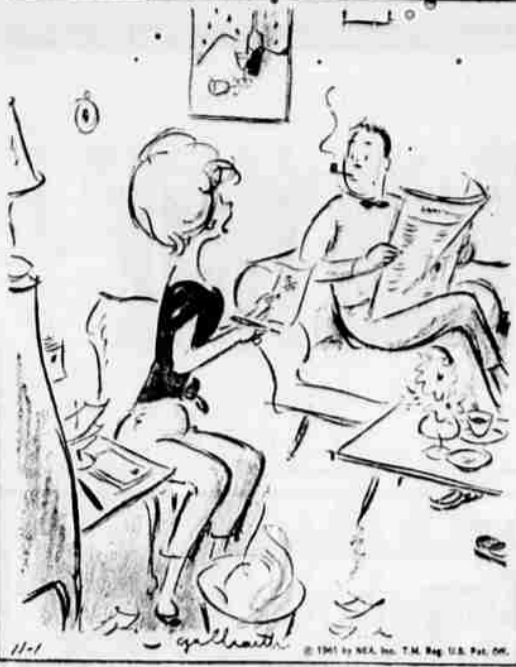
"If I've figured right, we have $25 left this month to make a down payment on something!"