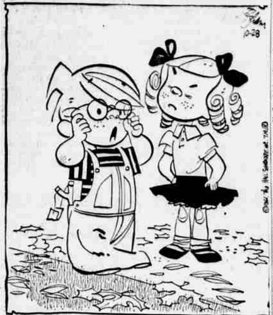
"WOW! NO WONDER YA CAN'T HIT THE BROAD SIDE OF A BARN!"