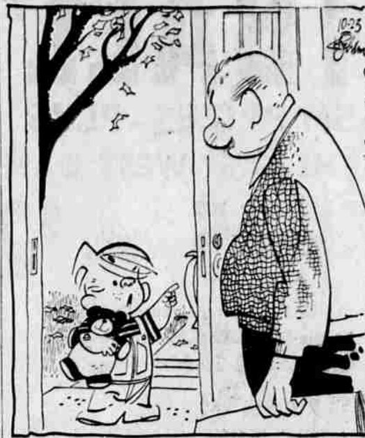
"IT'S A GOOD THING YOU ANSWERED! I WAS JUST ABOUT TO HUFF AND PUFF AND BLOW YOUR HOUSE DOWN!"