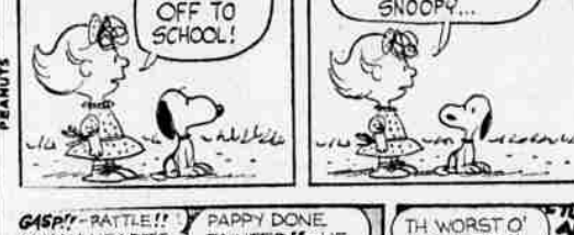
PEANUTS: THERE GO ALL THE KIDS... OFF TO SCHOOL!