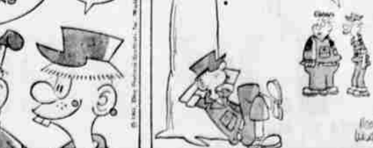
WHY DON'T WE EVER FIRE THOSE ROCKETS, GARGE?