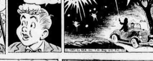
IF THE ENEMY EVER ATTACKS WE NEED SOMETHING SITTING THERE WAITING FOR THEM