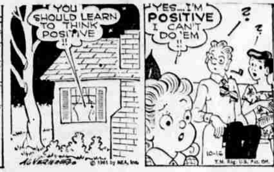
YOU SHOULD LEARN TO THINK POSITIVE!!