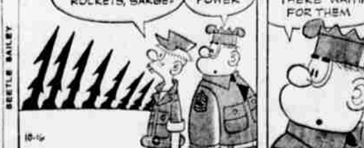
WHY DON'T WE EVER FIRE THOSE ROCKETS, GARGE?