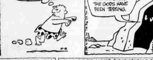
SOME PEOPLE SAY IT'S JUST NATURAL PHENOMENA