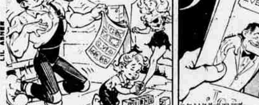
IT'S TERRIBLE, JUDY! I WAS JUST BEGINNING TO GET ON GOOD TERMS WITH YOUR FAMILY!