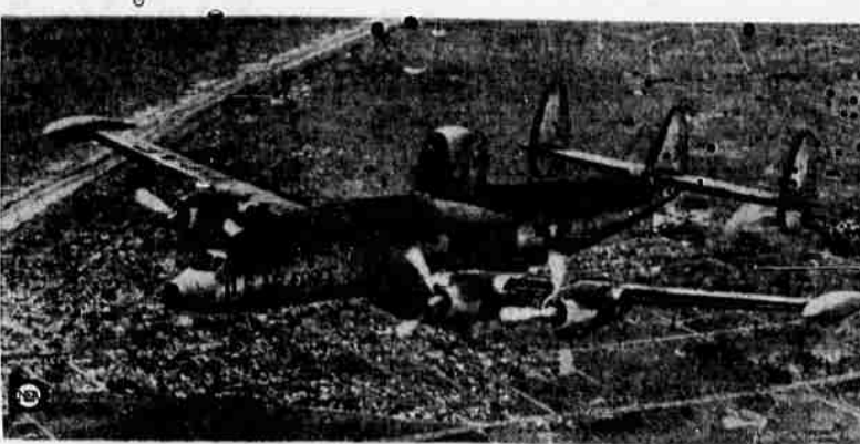
NAVY AIRBORNE RADAR PLANE — Here is one of the Navy airborne early warning radar planes that form the outerline of defense along the Atlantic and Pacific coasts.