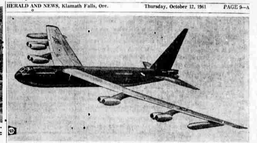
B-52's OF SAC — Any simulated attack will be carried out by planes such as the B-52 of the Strategic Air Command.